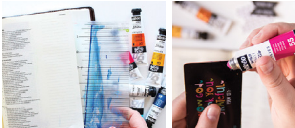
Place Bible mat under page. Dab paint.

Put 1/4" dot of paint on the end of the Paint-It Card and smear it on your Bible page or Paper Pad sheet to create a margin of color.